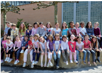
French school of Saarbrücken

Granting income based SCHOLARSHIPS to French children in the network's schools.