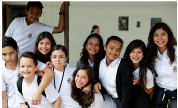
French high school Paul Valéry of Cali

2,315 training days within the framework of regional training centers